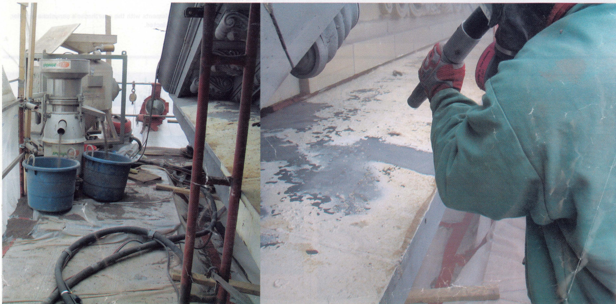
The Sponge-Jet blasting system was located on the same level as the work being done, allowing blasting and recycling to be carried out within feet of the blaster.