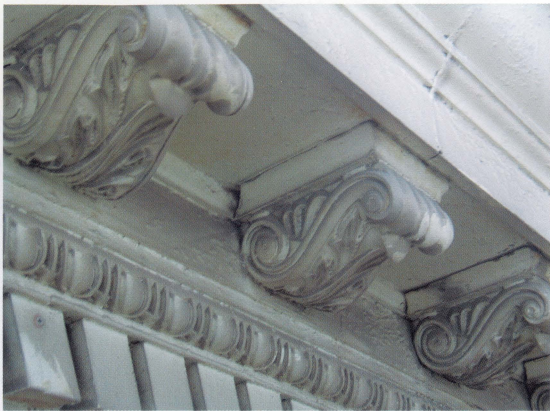
The white epoxy paint had failed in places, leading to cracks and potentially dangerous corrosion.