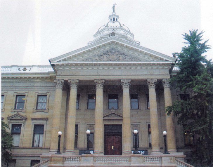
The repair, cleaning and painting of the cast-iron elements was the first phase of the ongoing structural and cosmetic restoration of Marion County Courthouse in Fairmont, WV.

Once secured, the cast-iron elements were cleaned and repainted. The goal – to remove multiple layers of lead-based paint without causing appreciable damage, or falling foul of EPA and OSHA requirements – posed significant challenges for conventional cleaning methods. Technologies such as sandblasting, high-pressure water cleaning, chemical cleaners and paint removers have been found to reduce