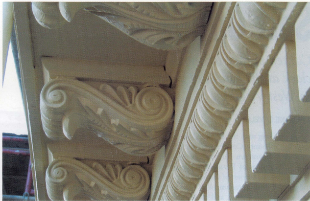
The cornices were re-anchored to the façade before being cleaned and repainted.

lead out of the sponge and then reusing the sponge. So we could get up there and remove the lead completely, and very easily."