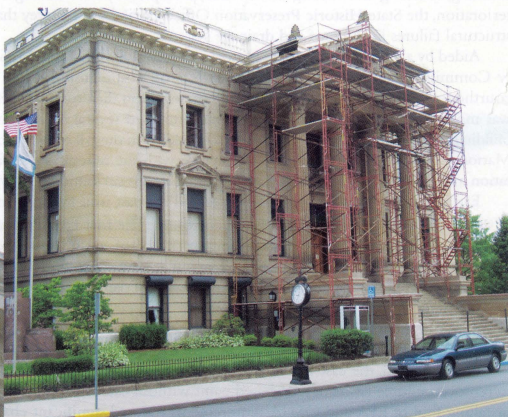
Above: Heavy-loading scaffolding was erected around the front entrance of the Marion County Courthouse while its cast-iron elements were repaired, cleaned and repainted.